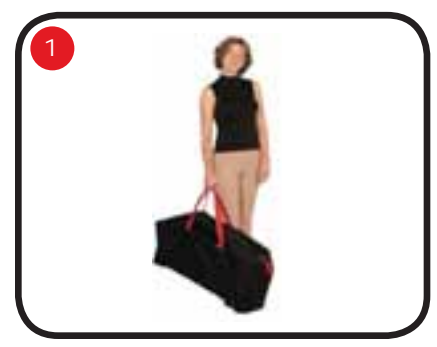
Unpack contents of bag.