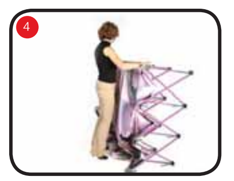
The graphic is fastened with velcro and unfolds as the frame opens.