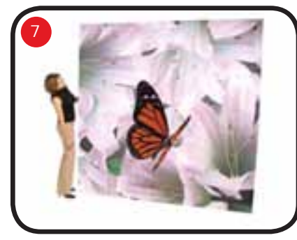
The graphic presentation is ready.