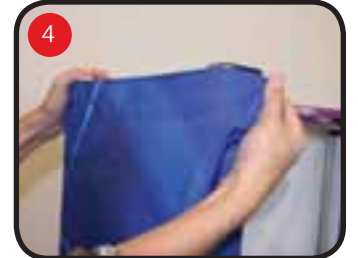
Disconnect the end caps in order to collapse the unit to disassemble. Open and remove all brace locks.