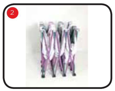
Frame, graphic and brace locks are attached.