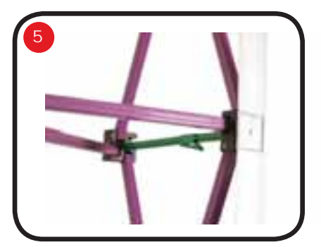
Once frame is fully opened, snap together all brace locks to secure frame.