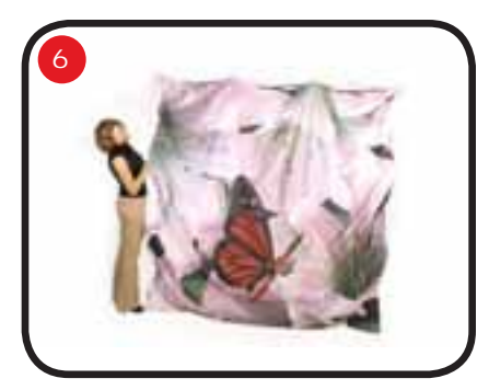
Graphic may be adjusted by using the Velcro fastening system.